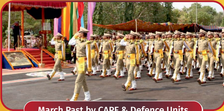
March Past by CAPF & Defence Units