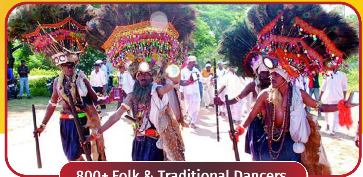
800+ Folk & Traditional Dancers