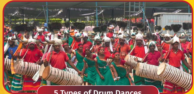
5 Types of Drum Dances