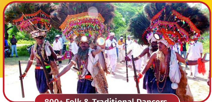
800+ Folk & Traditional Dancers