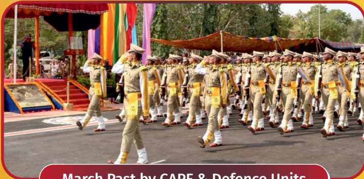
March Past by CAPF & Defence Units